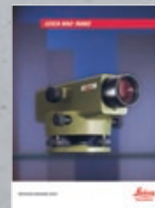
Leica NA2/NAK2 The classical, high-precision level