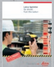
Leica Sprinter One-button digital level