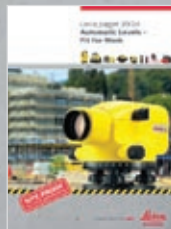
Leica Jogger 20/24 Automatic levels – Fit for Work

Ask your local Leica Geosystems dealer for more information about our TQM program.