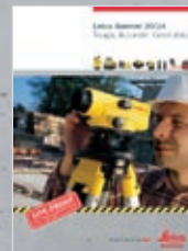
Leica Runner 20/24 Robust and value-priced automatic levels